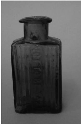
Example of a typical poison bottle.