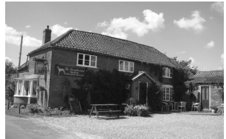
Greyhound pub, Tibenham, where the inquest into the murders was held.